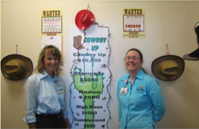
Patient Access employees use this sign to track the amount they have raised toward their sponsorship.