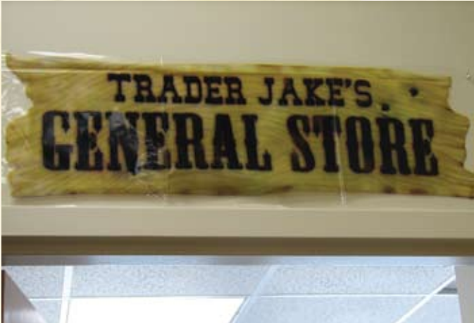
One of the business offices has become known as "Trader Jake's General Store." Employees can purchase a piece of bubble gum or a Tootsie Roll for only 25 cents. All proceeds go toward the New River Employees Sponsorship.