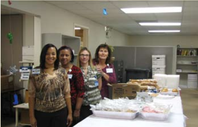
Several employees at New River hosted a Spaghetti Luncheon to raise funds for their Cowboy Up! sponsorship.